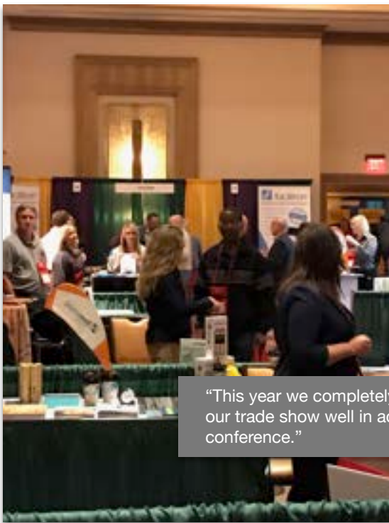
“This year we completely SOLD OUT our trade show well in advance of the conference.”